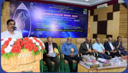
Govt. of India, Dept. of Space, Indian Space Research Organisation, Satish Dhawan Space Centre SHAR in Association with Jamal Mohamed College (Autonomous), Trichy World Space Week 2023 on 06.10.2023