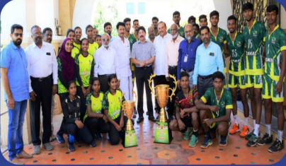
Our Jamal Mohamed College Volleyball Team (Men) won the State Level Volleyball Tournament conducted in honour of Kalaignar Centenary year celebrations organized by Trichy District (South) Sports Development Wing held at Jamal Mohamed College Indoor Stadium on 03.09.2023. Also our Women Volleyball team secured 2nd Place (runner-up).