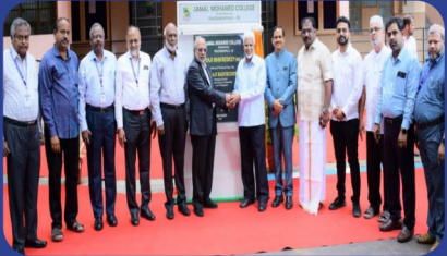
Opening Ceremony of T. M. Haji Badurudeen Hall on 29.09.2023