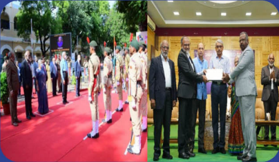
NAAC Peer Team Visit on 20 & 21.09.2023