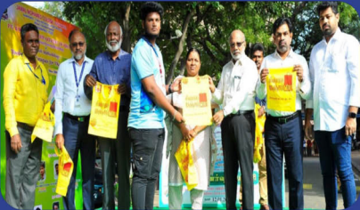
மீண்டும் மஞ்சள்பை - Awareness Campaign at our College