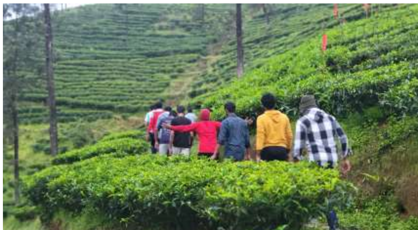
Our Team analysing for any pest damages in the Tea plantations

The next day started with a misty freezy weather, learned field survey techniques such as analysing the levels of pest infestation in Tea plantations. After the breakfast prepared by own students, we moved to Chinna Kallar forest with the guidance of Forest guard. He explained the different ecosystem, Vegetation and their conservation steps practised by the forest department in the range areas. The Grasslands in the forest and the Shola forest bring plenty of water to the catchment of Aliyar dam, Pollachi. Thus, the Two-day visit enabled our students acquire better understanding on the numerous modern techniques, methodologies involved in Entomological studies and Conservation strategies in the Western Ghats. It was a great experience to our PG students to take up ecological Research as their future endeavour!