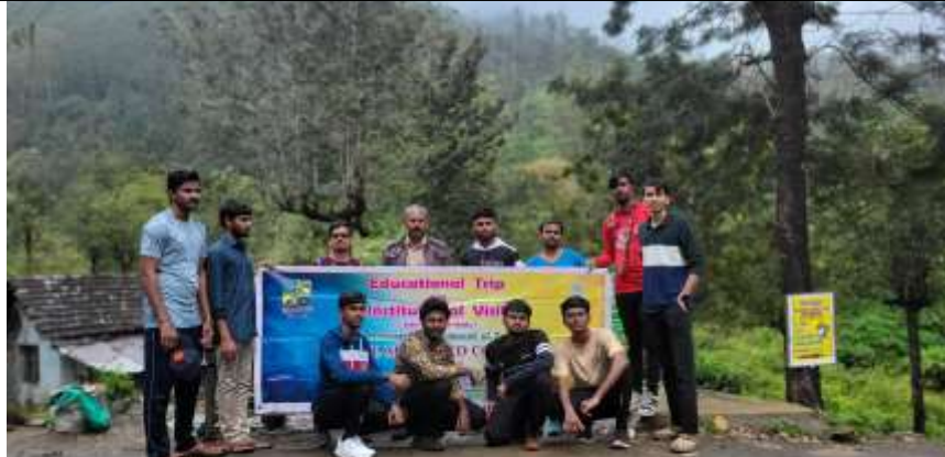
...while trekking through the deep forest and woods in the Western Ghats