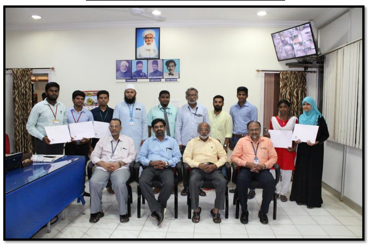
ATMECS SELECTED CANDIDATES WITH OFFER LETTER