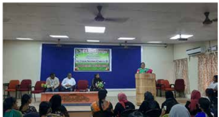
The Chief Guest delivering an interactive & motivational speech on “Women’s Role in the Society”