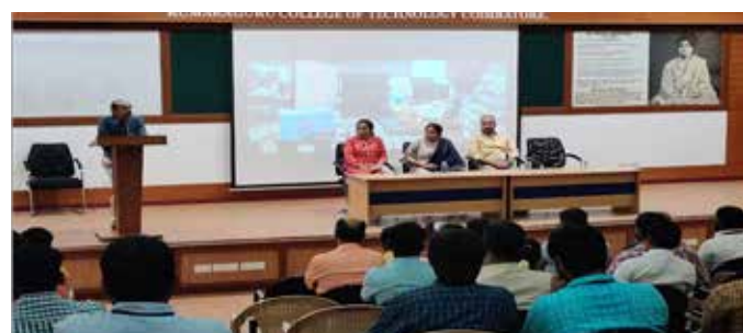
Participation of our Jamal Innovation and Incubation Centre members in Regional Mentoring Session for IIC & ARIIA 2020 on 29th July 2019 at Kumaraguru College of Technology, Coimbatore