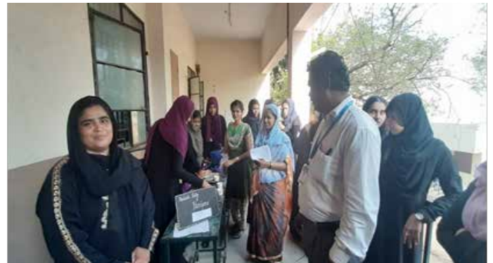
A Glimpse of the Presentations by the Participants in COM FAIR 2020