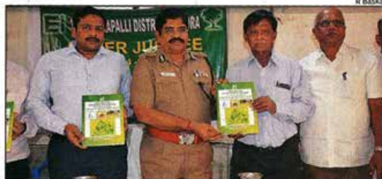
Trichy city police commissioner V Varadharaju releasing the silver jubilee souvenir of Trichy district Exnora.

sioner V Varadharaju, who was the chief guest of the event, urged the public and representatives of NGOs present to take