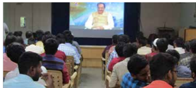
Webinar Talk Series on, India First Leadership by Hon'ble Minister Dr. Ramesh Pokhriyal, Ministry of Human Resource and Development, Govt. of India. on 22/07/2019