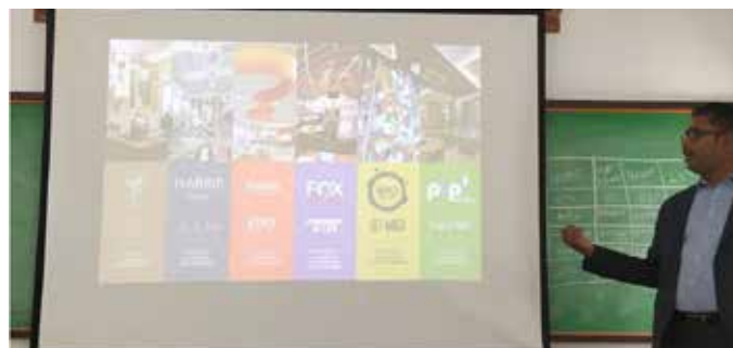
Officials of Somerset Green Ways, Chennai explain their recruitment policies to our students of Hotel Management