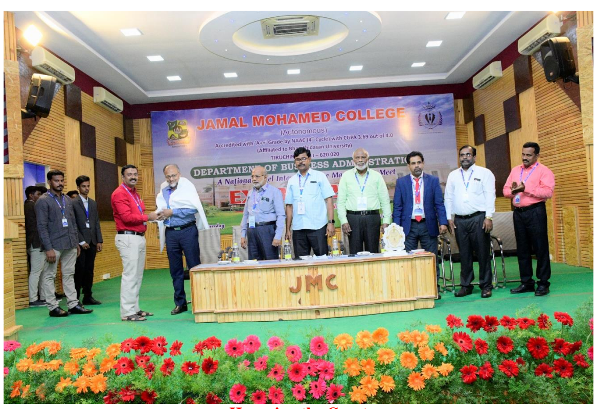
Honoring the Guest