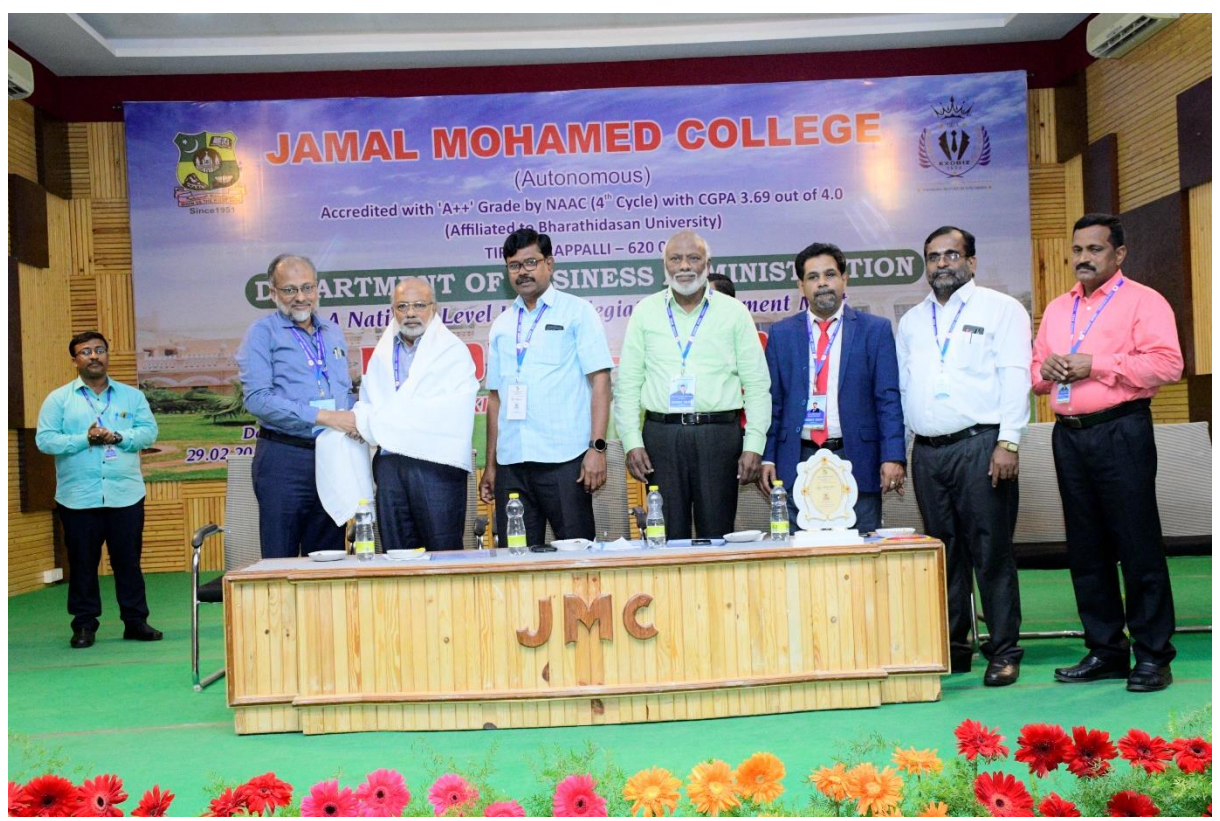
Honoring the Guest