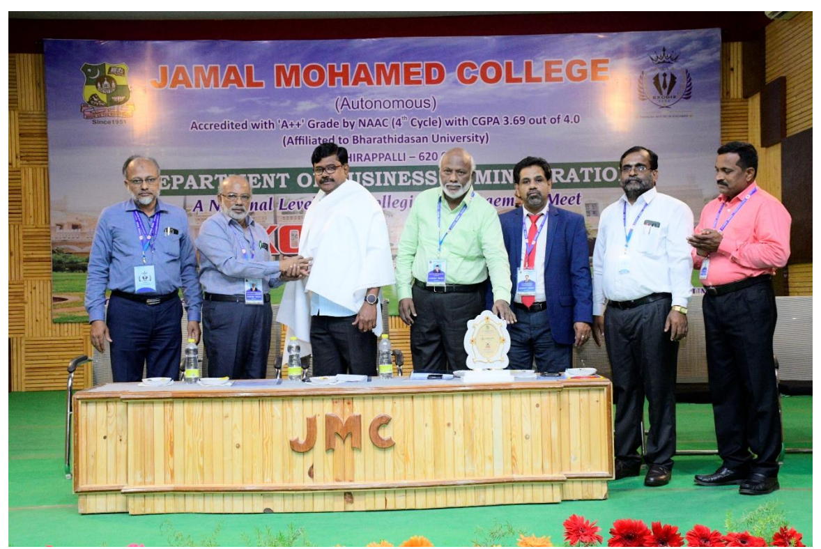
Honoring the Guest