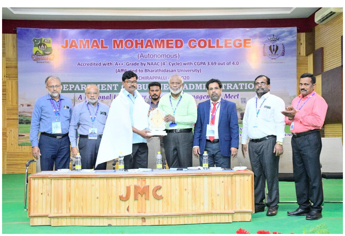
Honoring the Guest