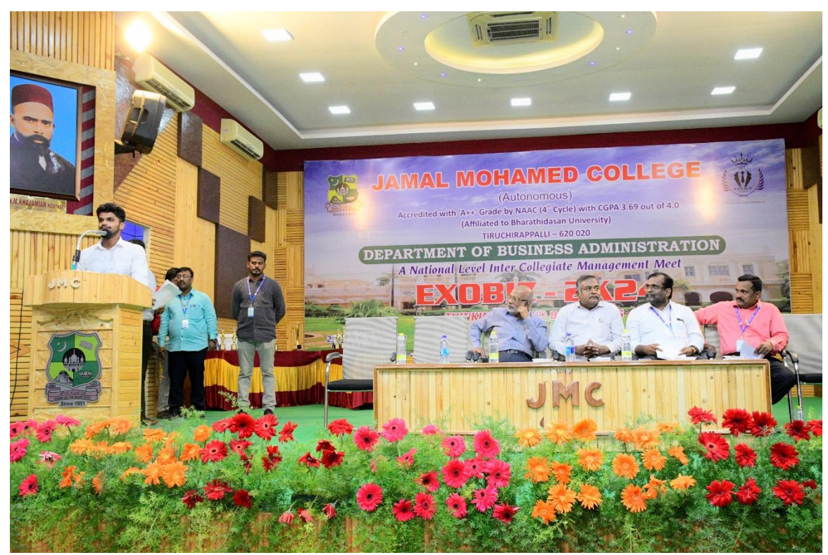
Feedback by Participants