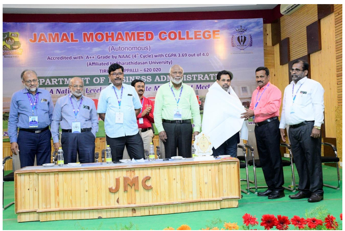
Honoring the Guest