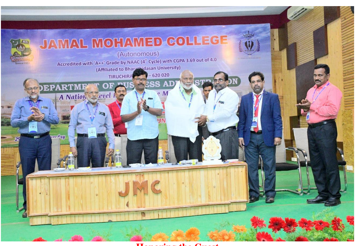
Honoring the Guest