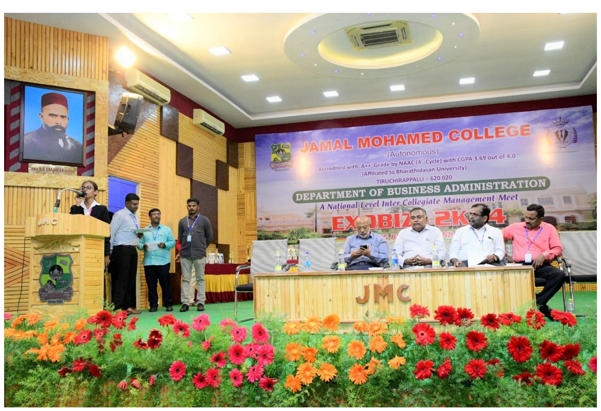
Feedback by Participants