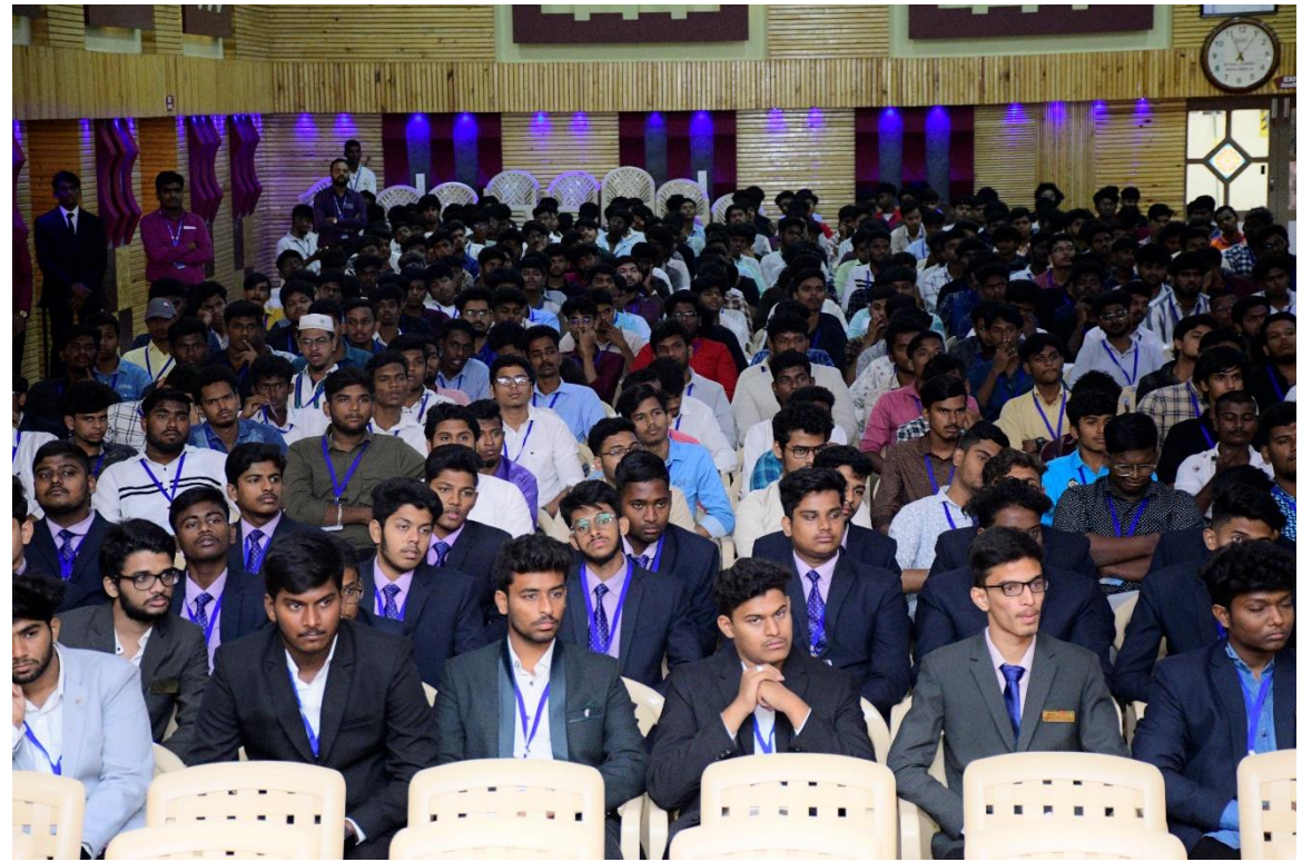
Glimpse of Participants