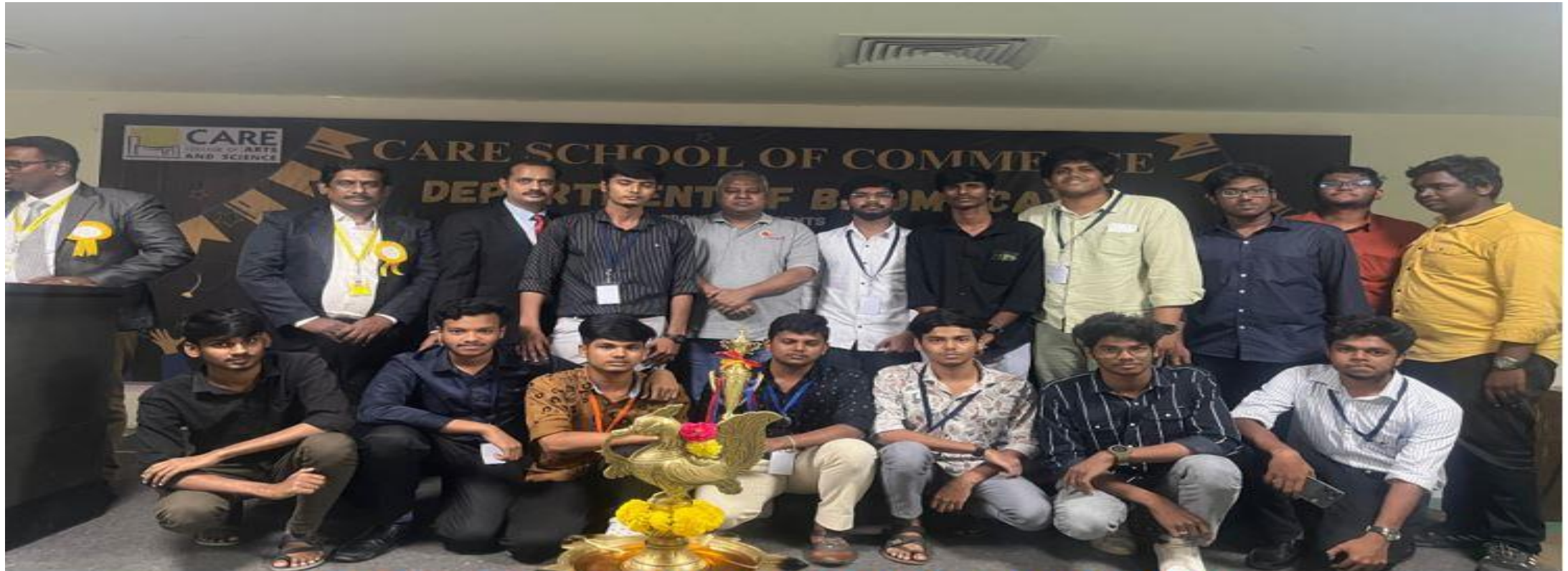
CARE-ASPIRE, A State Level Inter-Collegiate Meet CARE College of Arts and Science, Trichy On 08-02-2025.

College :Care College of Arts and Science , Trichy