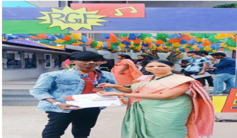
TAMIL ELOCUTION Winner of RGF Festival of students -25, INDIA'S TECHNO-CULTURAL FEST RATHINAM GROUP OF INSTITUTION On 26-03-2025.