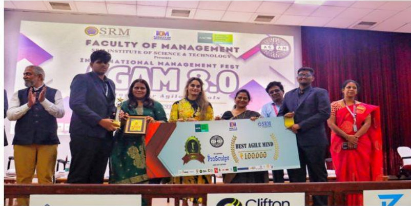
Case Study Winner AGAM 8.0 International Management Fest SRM Institution of Science & Technology On 12-03-2025 to 14-03-2025

College :SRM Institution of Science & Technology,kattankulathur