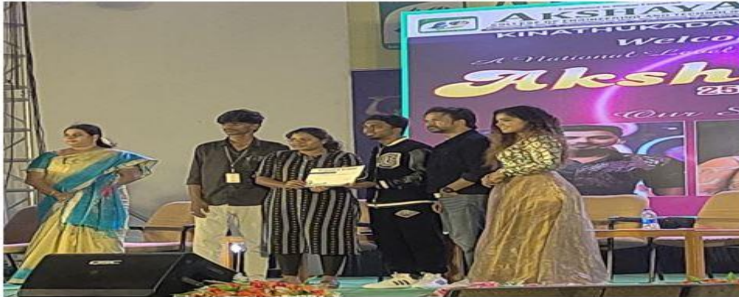
TAMIL ELOCUTION Winner of AKSHARIKA-25, National Level Intercollegiate Cultural Fest AKSHAYA Art & Science, Coimbatore On 25-03-2025.

College : AKSHAYA Art & Science, Coimbatore