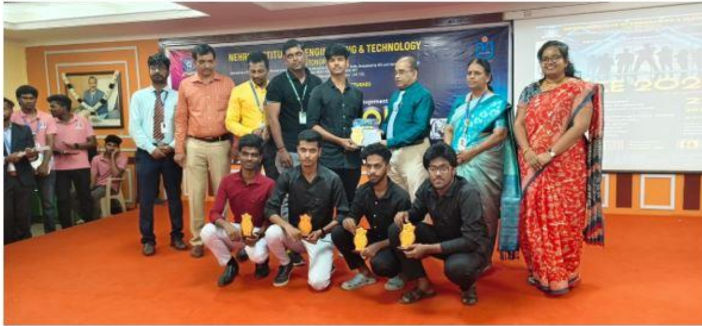
AD-ZAP Winner of NICE 2025, National Level Intercollegiate Management Fest Nehru Institution of Engineering & Technology, Coimbatore On 21-03-2025.

College : Nehru Institution of Engineering & Technology, Coimbatore