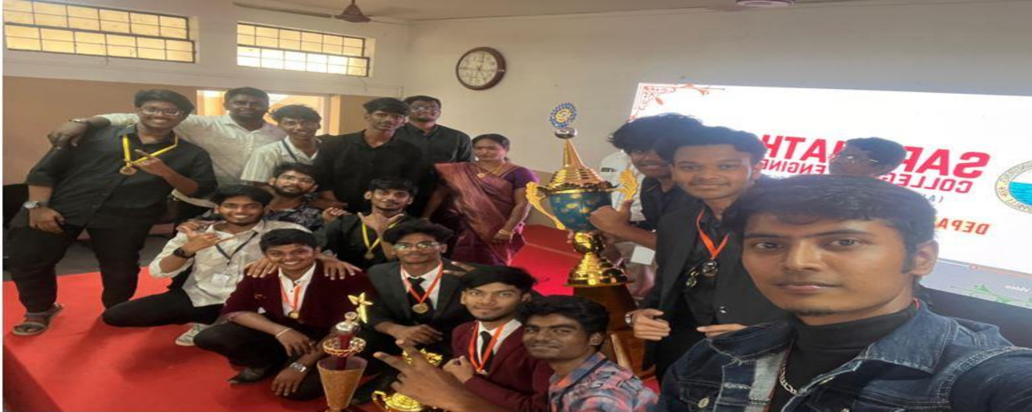
LAKSHYA 2k25, A State Level Management Meet. Saranathan College of Engineering, Trichy. On 22-02-2025.

College: Saranathan College of Engineering , Trichy