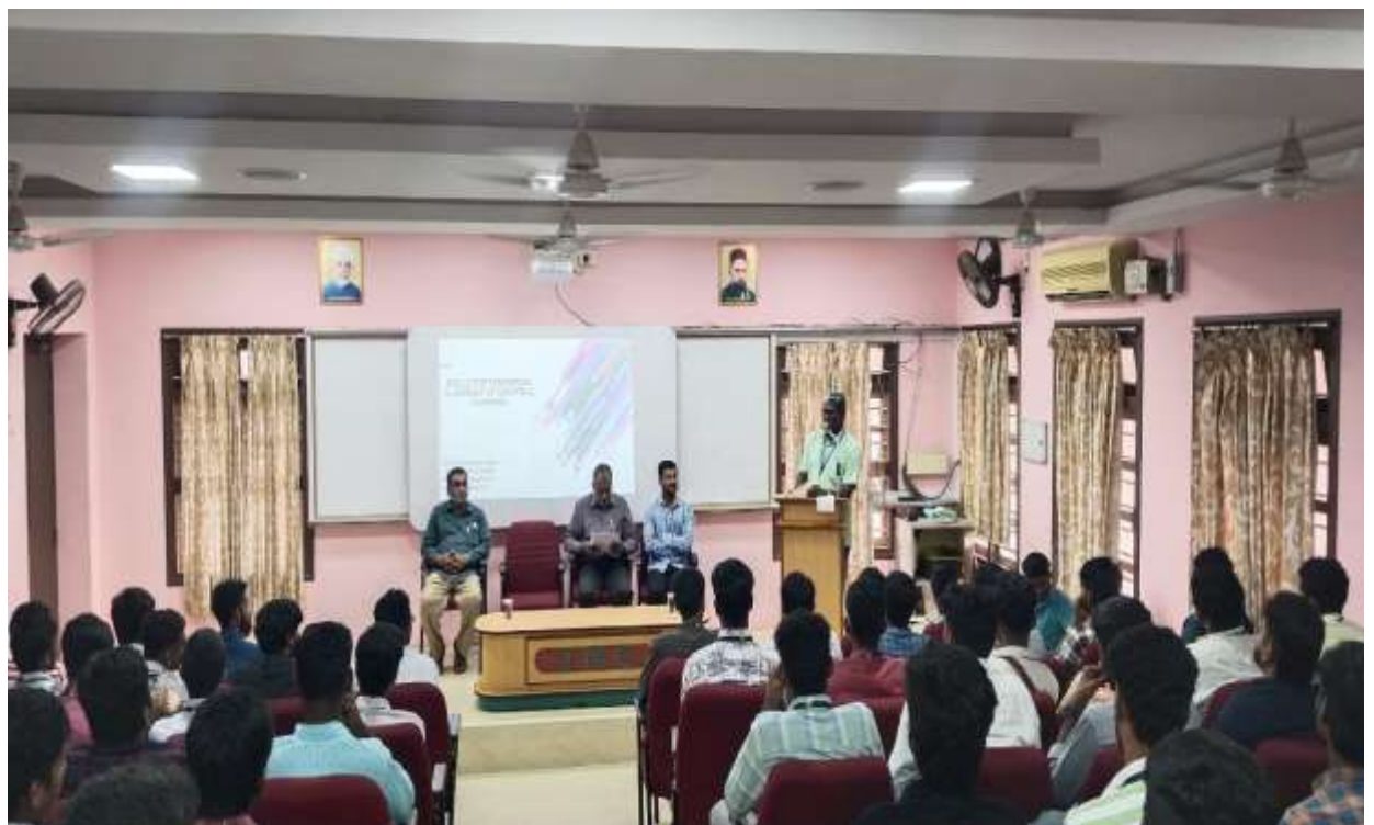
UG Students were taking participation in this event.