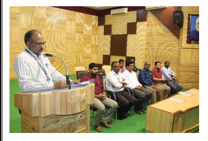
Principal giving presidential address