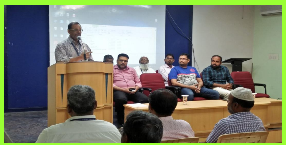
Our Beloved Vice-Principal giving the Presidential address