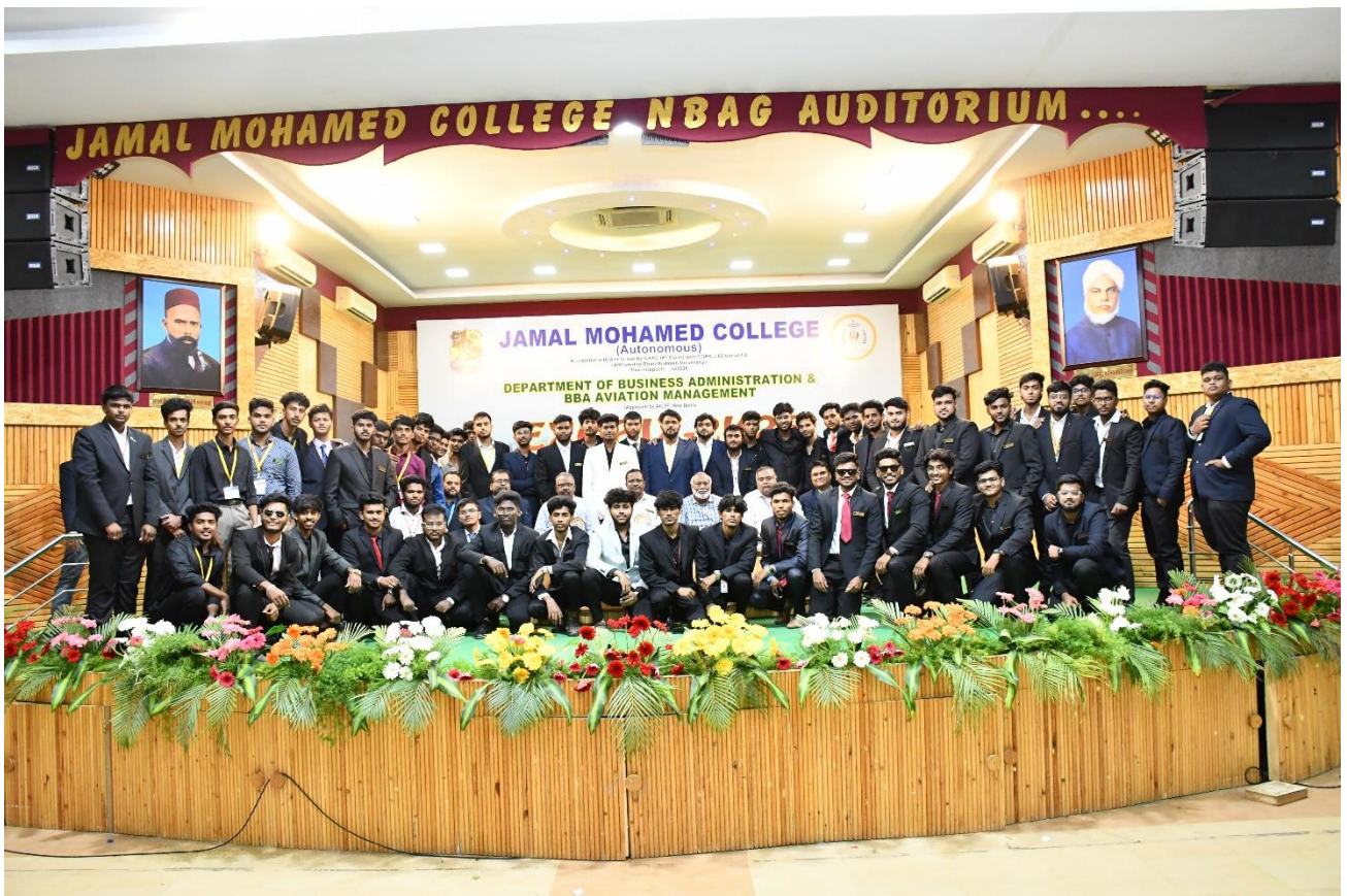
Office Bearers and Event Incharges of Exobiz 2K25 along with dignitaries