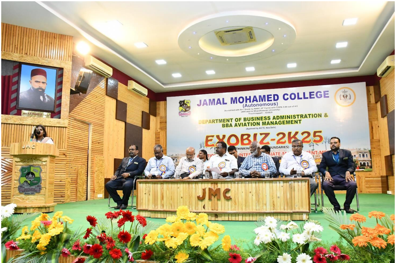
Feedback given by Participants