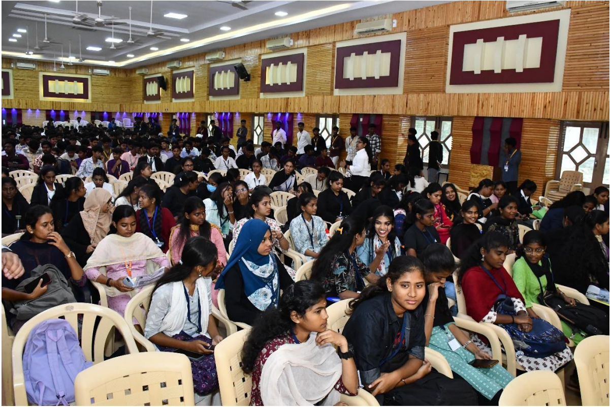
Glimpse of Participants in the welcome ceremony