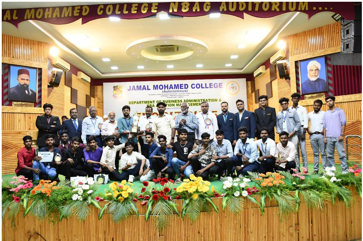
The participants from MIET Arts & Science College being awarded the Overall Winners Trophy of Exobiz 2K25.