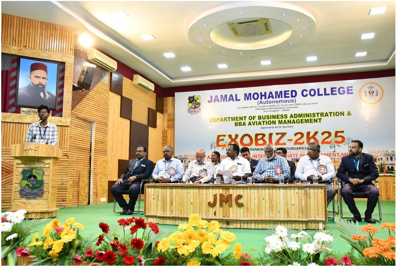
Feedback given by Participants