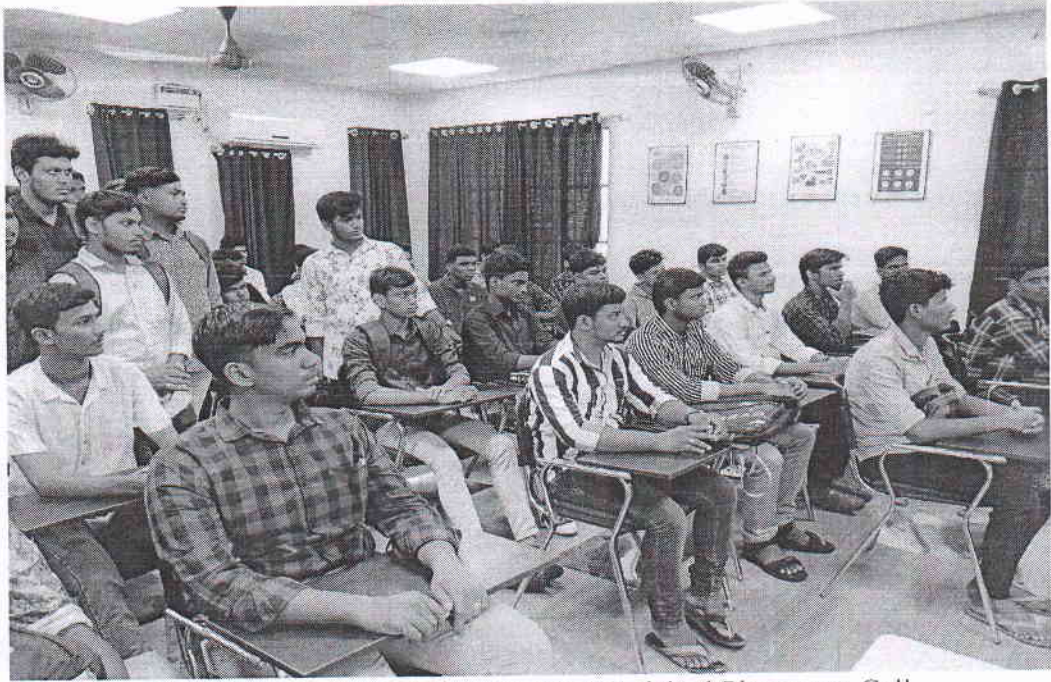
First Year students of B.Sc (AI&ML) visited Placement Cell