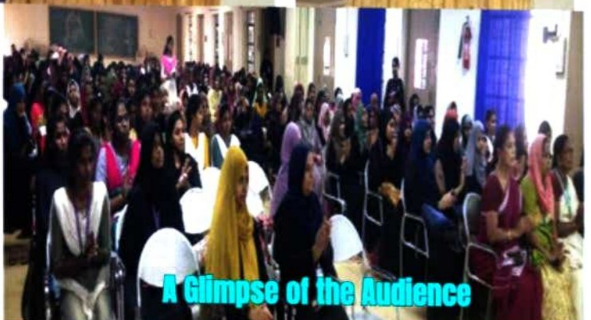
A Glimpse of the Audience