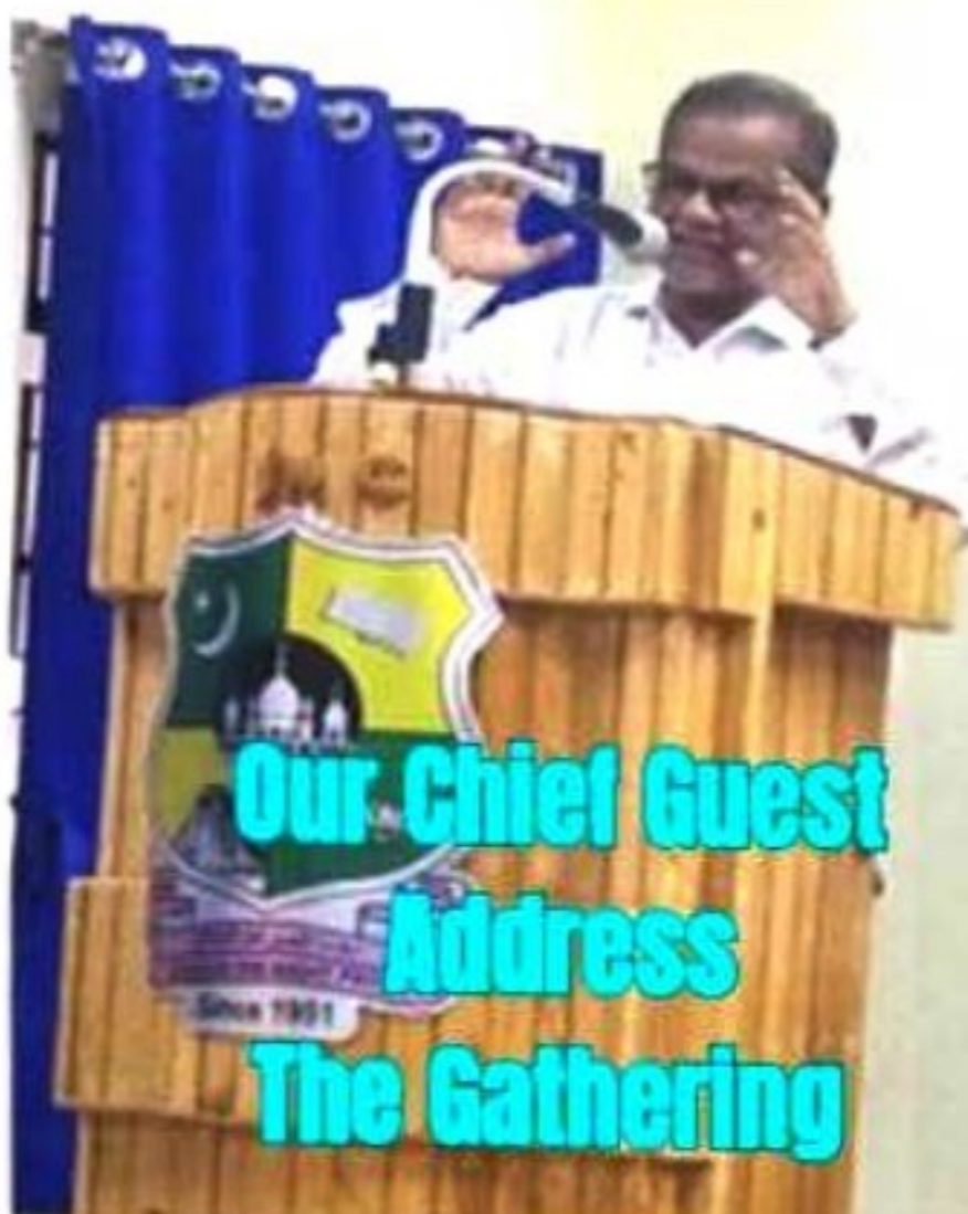
Our Chief Guest Address The Gathering