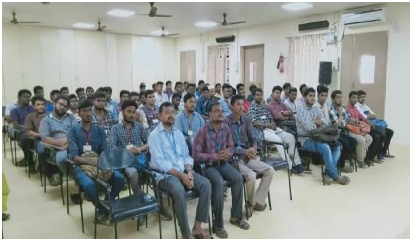
Staff Members and Student Participants of the Special Lecture Programme.