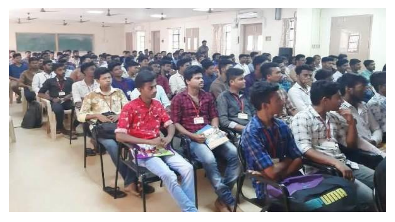
Students' Participants of Tally with GST Awareness Programme