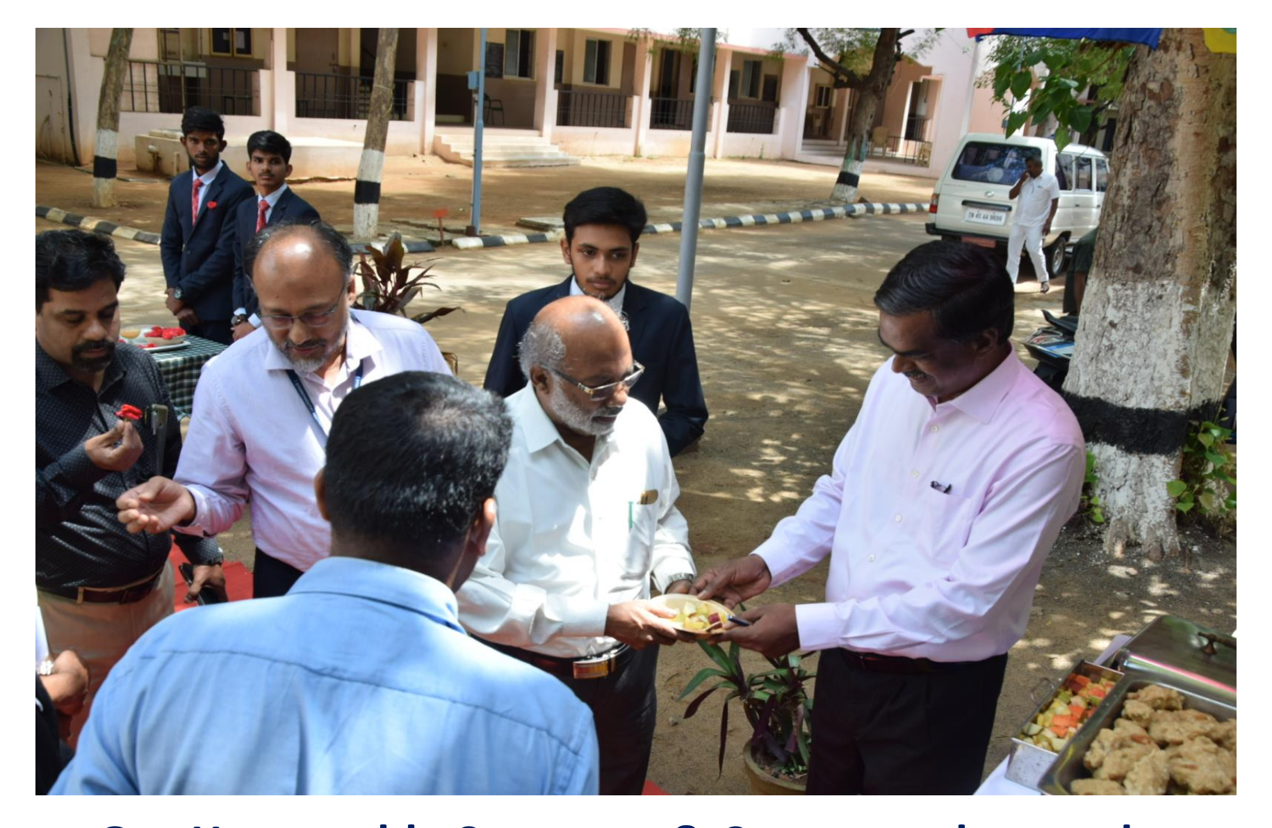
Our Honourable Secretary & Correspondent and our Chief Guest inaugurate the first sale of NUTRITIA