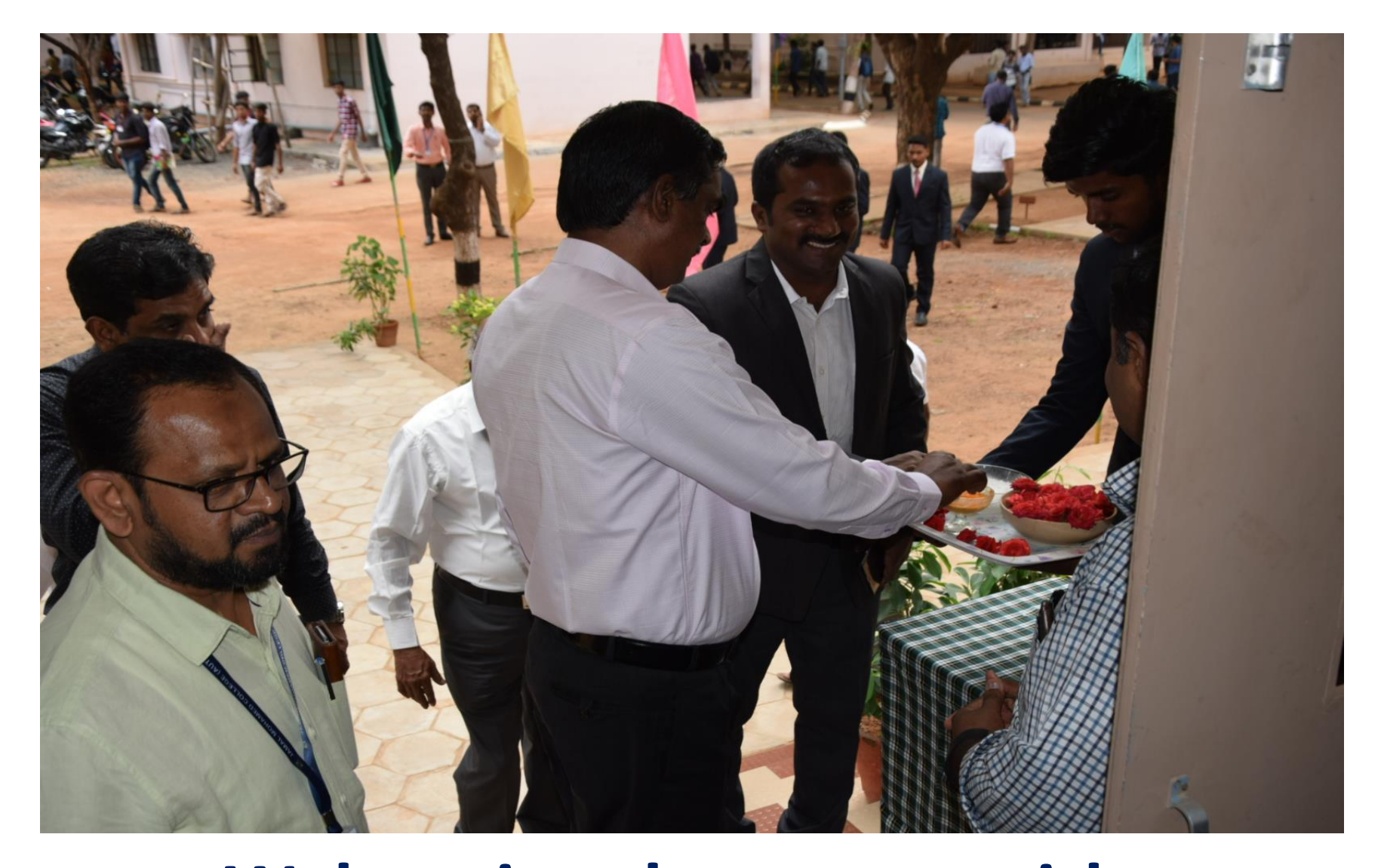
Welcoming the guests with a pleasant hospitality