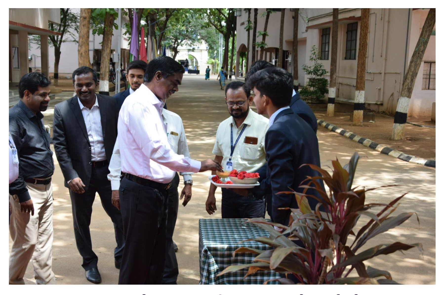
A warm welcome given to the delegates