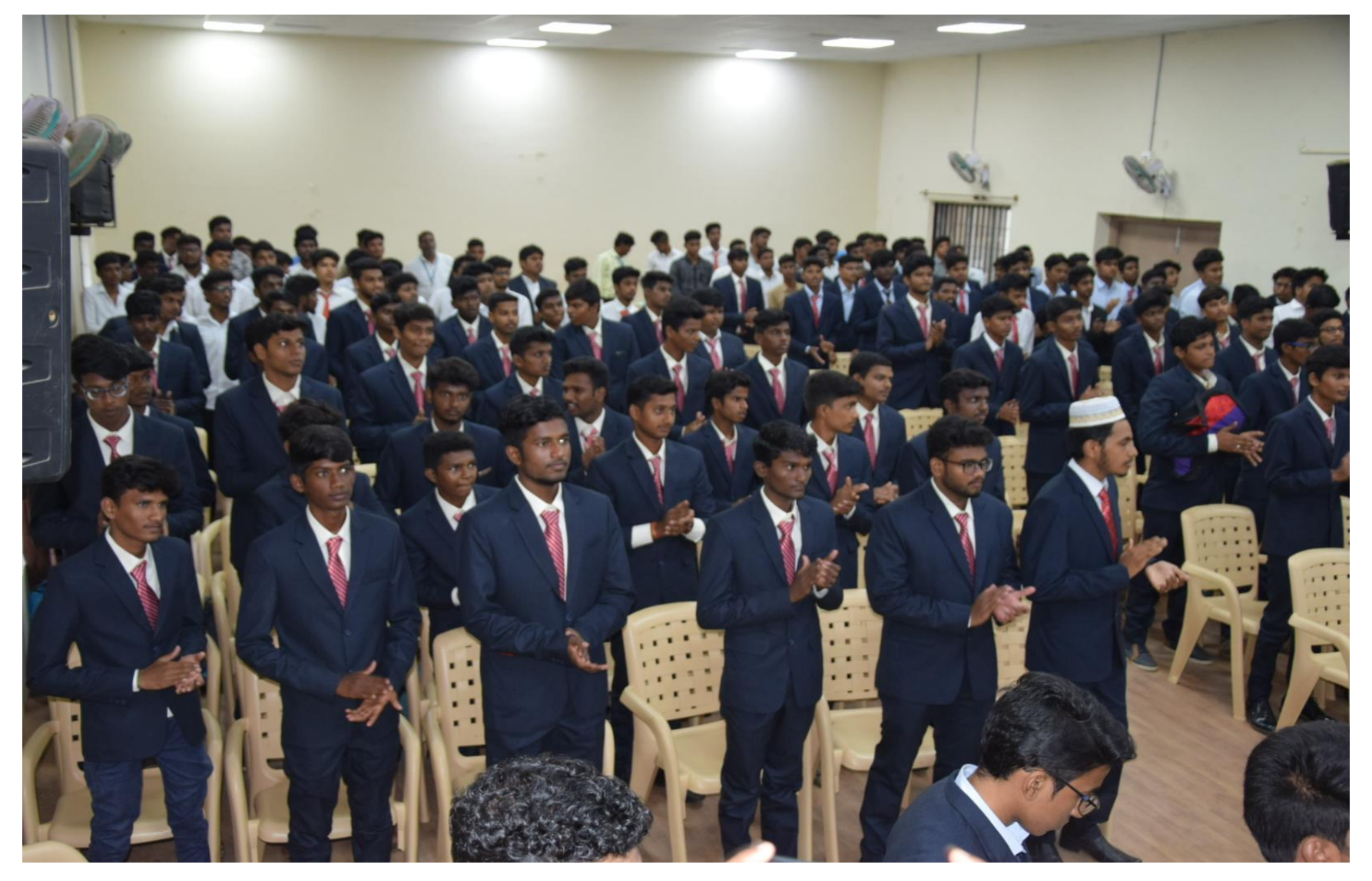
Our students of HMCS offer standing ovation to guests