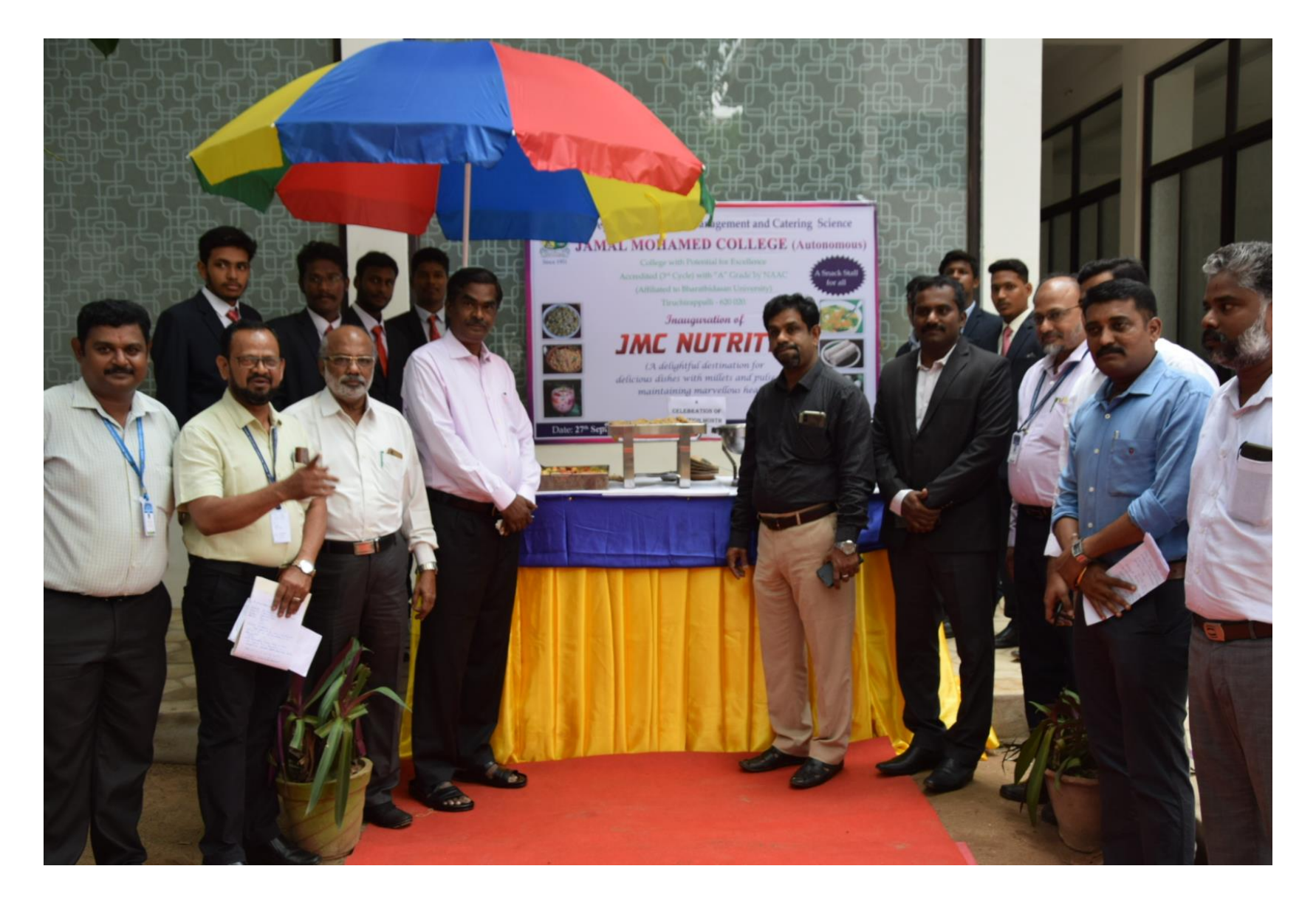
Inauguration of "NUTRITIA" Stall