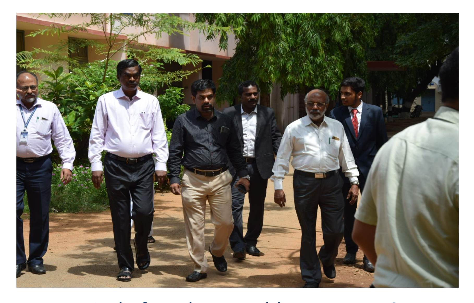
Arrival of our honourable Secretary & Correspondent, Principal and Chief guests