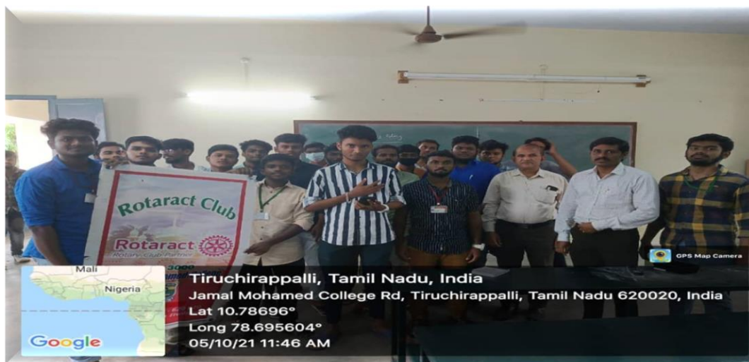
(05.10.2021) Social Evil Pledge against Women and Children was taken on behalf of the Rotaract Club of Jamal Mohamed College.