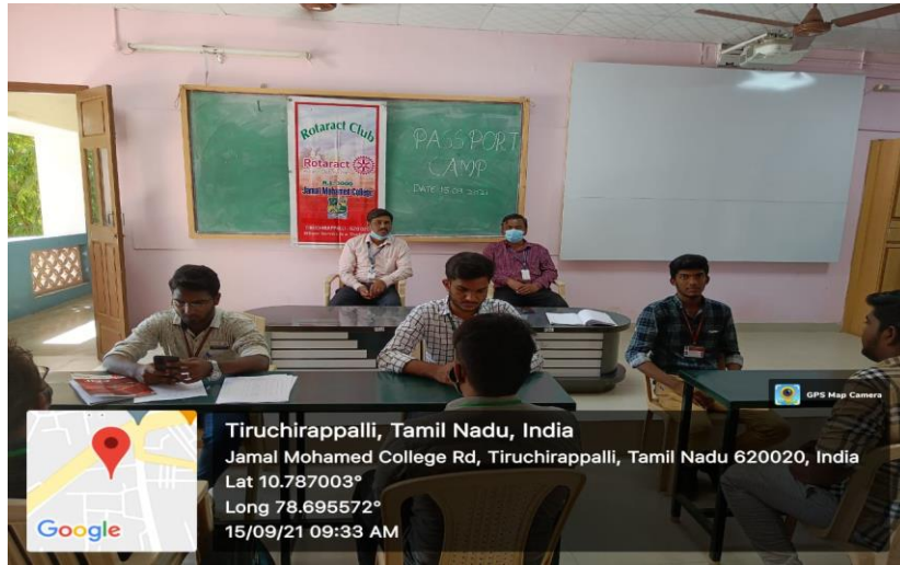
Passport Camp (15,16,28 and 29 - 09.2021)