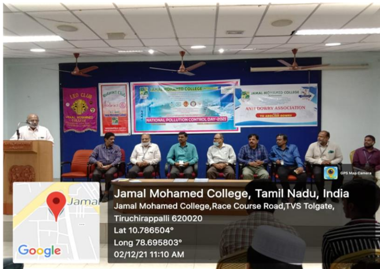
On National Pollution Control Day on 02.12.2021 special awareness programme was organised by in our College jointly with Water Environment Student Forum, Student Exnora, Anti Dowry Association and Leo Club.