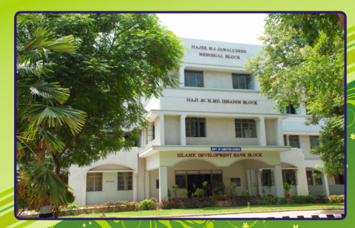
Hajee. M. J. JAMALUDEEN MEMORIAL BLOCK

Printed at : Deque Press, Try - 20, Ph : 2420449